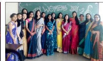
Women's day Celebration