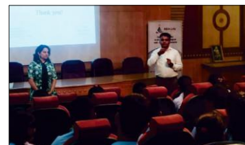
Guest Lecture on Career Guidance